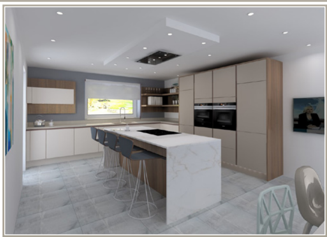
Hall Lane House

Harbury is an established village with a great community spirit. It offers everything you need on a daily basis - from a school, a doctor's surgery and post office, through to a mini-supermarket, park and great pubs. Just three miles away is the market town of Southam and eight miles is Leamington Spa. The train station at Leamington Spa provides services between Birmingham and London Marylebone, the village also benefits from good links to the A423 and the M40.