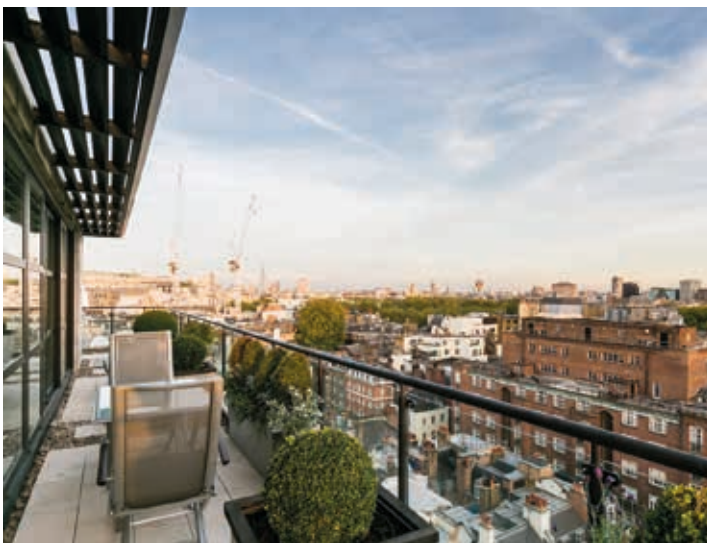
DUPLEX PENTHOUSE WITH WRAP AROUND TERRACING Extraordinary panoramic views over London and 2 secure underground parking spaces. £15,500,000