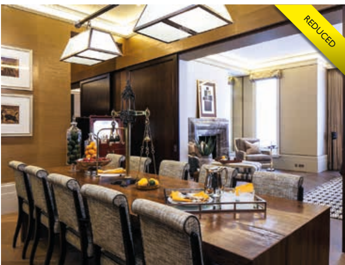
A NEWLY REFURBISHED AND INTERIOR DESIGNED FIRST FLOOR APARTMENT WITH VIEWS TOWARDS BERKELEY SQUARE £6,750,000

A stunning south facing second floor apartment of 2,303 Sq Ft with 45Ft frontage. £7,150,000