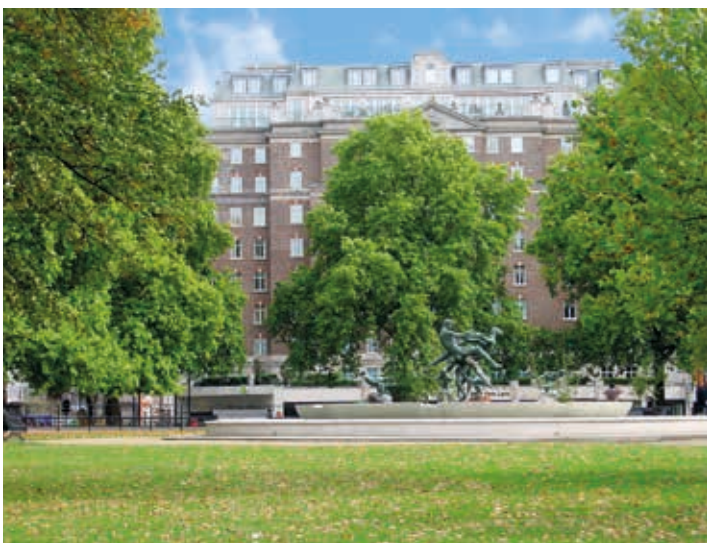
JUST LAUNCHED: A 4 BEDROOM APARTMENT ON HIGH FLOOR OVERLOOKING HYDE PARK £7,250,000

A selection of luxurious 2 bedroom apartments (from 1,659 Sq Ft) with private roof terraces with views over Park Lane and Hyde Park. 24 hour portorage. From £2,300 p.w.