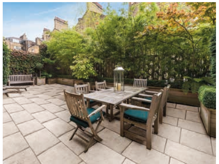
REEVES MEWS - AN ATTRACTIVE SOUTH FACING 3 BEDROOM APARTMENT OF 1,472 SQ.FT One of the largest roof terraces in the heart of Mayfair. £4,750,000