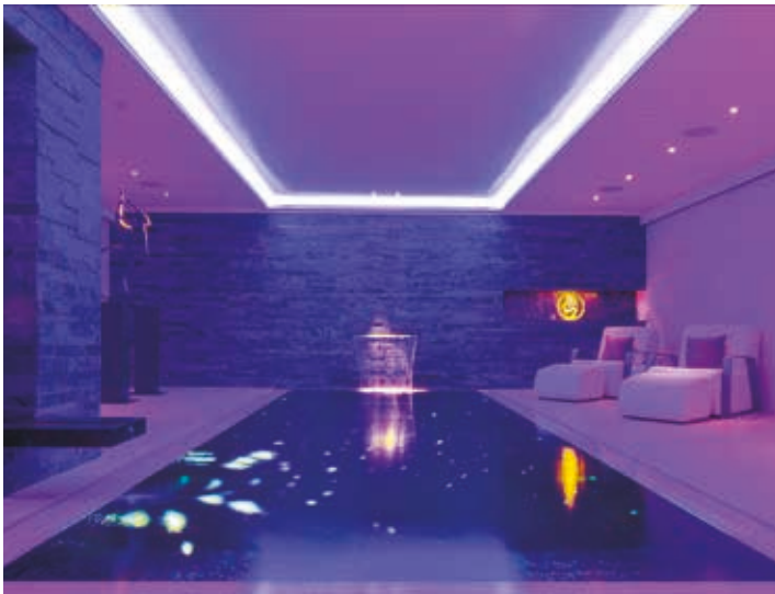
FARM STREET - AN IMMACULATE NEWLY BUILT FREEHOLD MANSION HOUSE OF 8,139 SQ.FT Parking, roof terrace and swimming pool. £25,000,000