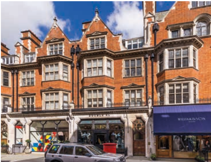
A NEWLY REFURBISHED 3RD FLOOR 2 BEDROOM APARTMENT OF 1,425 SQ FT WITH SOUTH WESTERLY VIEWS £4,500,000