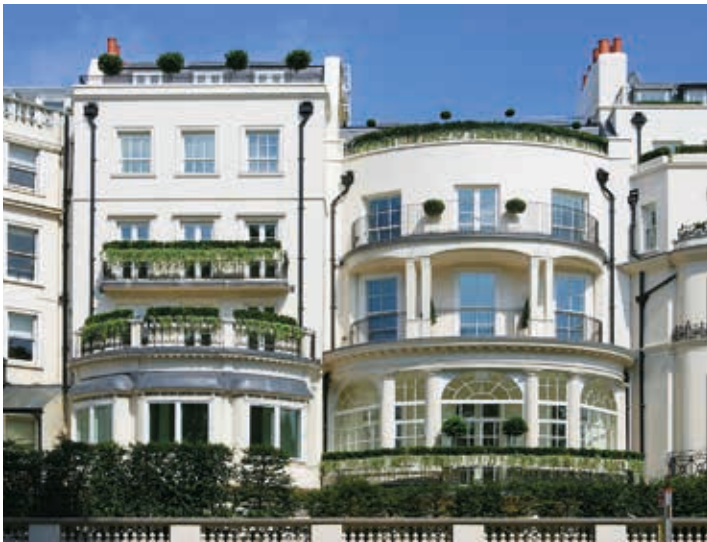
3RD FLOOR 3 BEDROOM APARTMENT OF 1,815 SQ.FT OFFERING LARGE LATERAL SPACE WITH VIEWS TOWARDS HYDE PARK Two balconies. Porter: £6,750,000