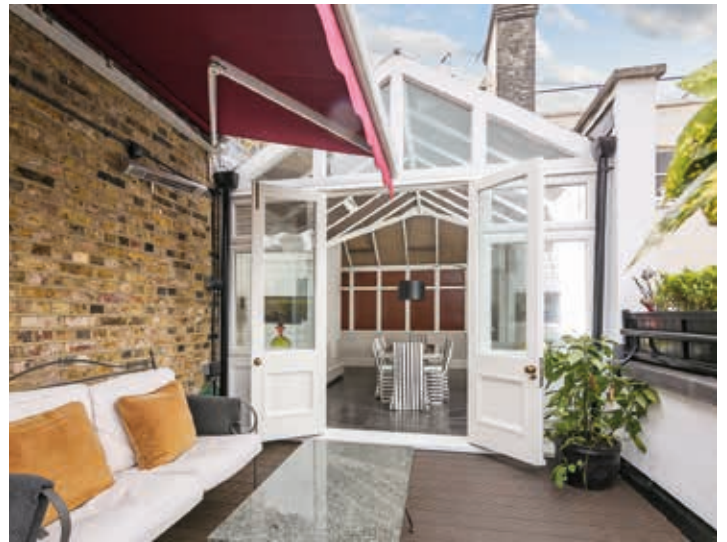
UPPER GROSVENOR STREET - ONE OF MAYFAIR'S PREMIER STREETS A stunning south facing apartment spanning 2,212 Sq Ft with high ceiling and private terrace. £5,600,000